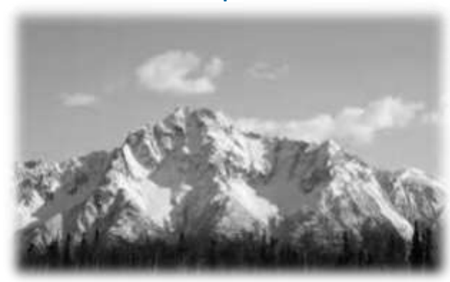
December 4, 2016

Mission of Valley church of Christ ... Make Disciples... Matthew 28:19