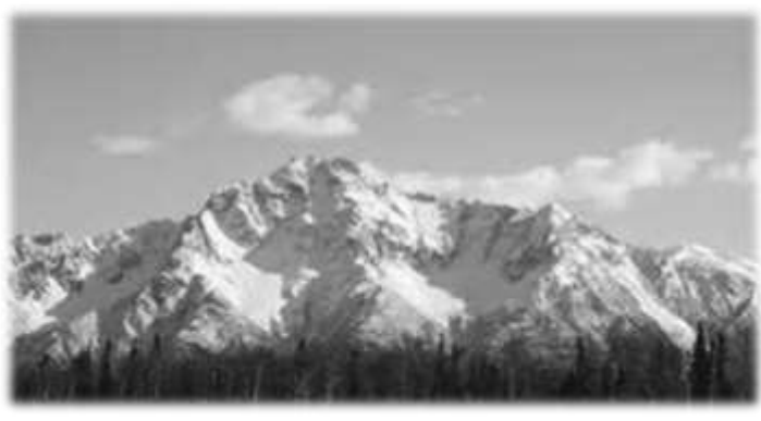
May 12, 2024

Mission of Valley church of Christ ...Make Disciples...Matthew 28:19