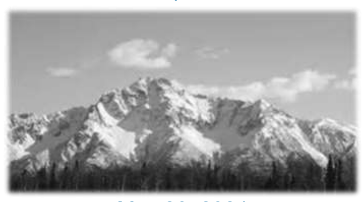
May 26, 2024

Mission of Valley church of Christ ... Make Disciples... Matthew 28:19