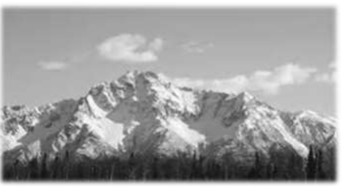
June 16, 2024

Mission of Valley church of Christ ...Make Disciples...Matthew 28:19