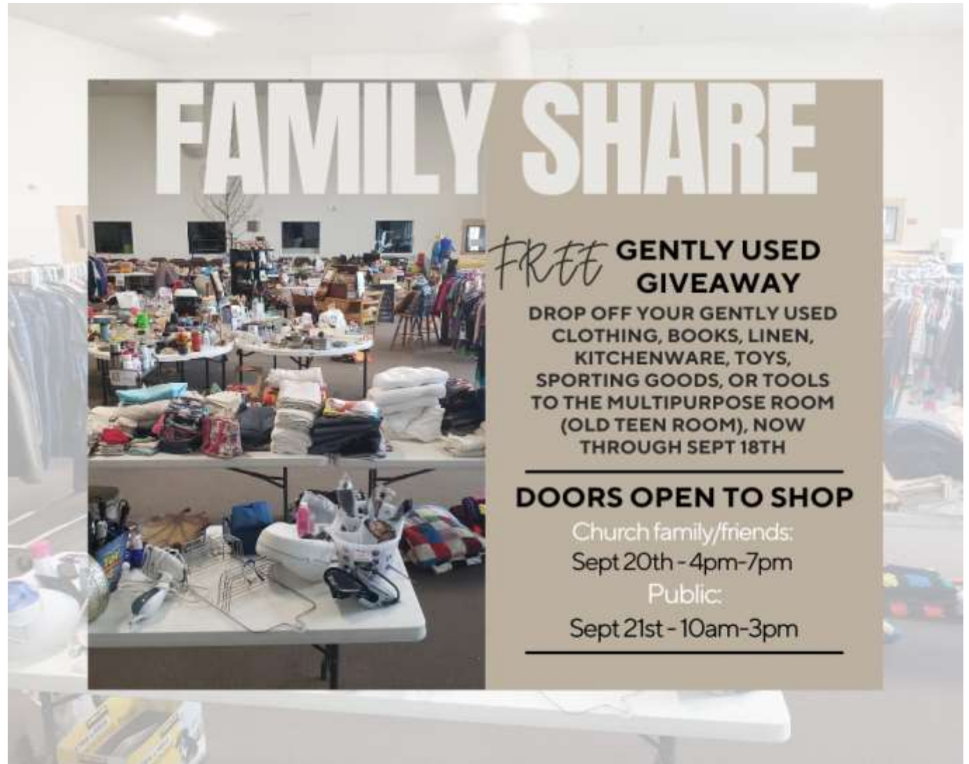
See Invitation on the table in the foyer