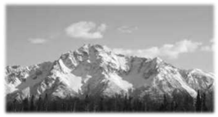
September 15, 2024

Mission of Valley church of Christ ... Make Disciples... Matthew 28:19