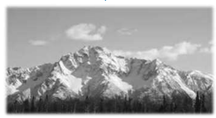
March 2, 2025

Mission of Valley church of Christ ... Make Disciples... Matthew 28:19