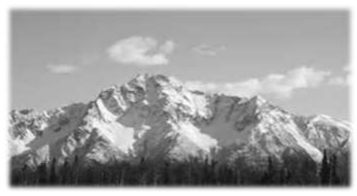
May 18, 2025

Mission of Valley church of Christ ... Make Disciples... Matthew 28:19