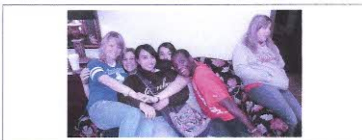
A few of my classmates and I, the one in blue is my roommate, the one behind me is my other roommate.

Some of the countries and places that presented were: Ghana, South Africa, Nigeria, China, India, Europe, etc. There was not a Romanian presentation. Along with that were classes (throughout the day) on how to start ministries and continue them and how to make things in the church run smoothly.