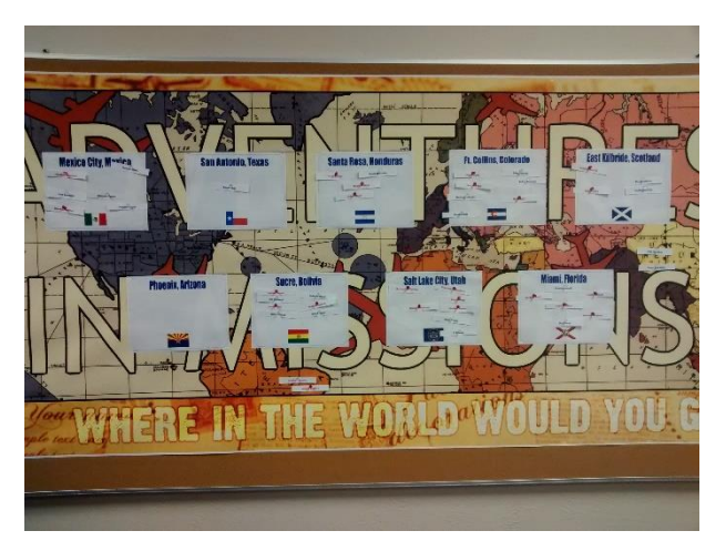
This board gives us a chance to see where others want to go