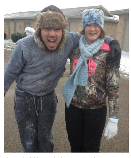
A couple AIMers enjoying their time in the snow

"YOU MAKE KNOWN TO ME THE PATH OF LIFE; IN YOUR PRESENCE THERE IS FULLNESS OF JOY; AT YOUR RIGHT HAND ARE PLEASURES FOREVER MORE." PSALM 17:11 (ESV)