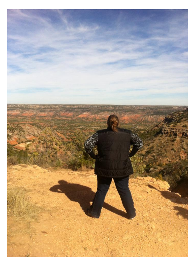
The view out at the middle school retreat