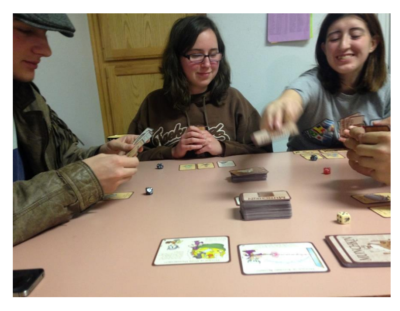
Playing a game of Munchkin over Thanksgiving break

To most everyone's surprise, we got a bit of snow here on November 16. It was a bit shocking for how early it is in the season down here, but it was appreciated. The snow really helped me feel a little more at home for this time of year, and there were even a couple AlMers that had never seen snow before. Snowballs were thrown, people got wet, and everyone enjoyed having a late start to classes the next day.